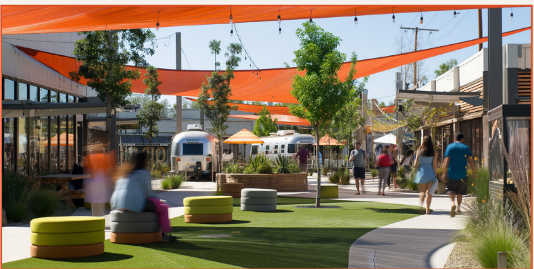
C FOOD KIOSK ALLEY & CHILDREN'S PLAY AREA