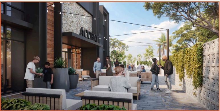
B LUSH COVERED PATIOS