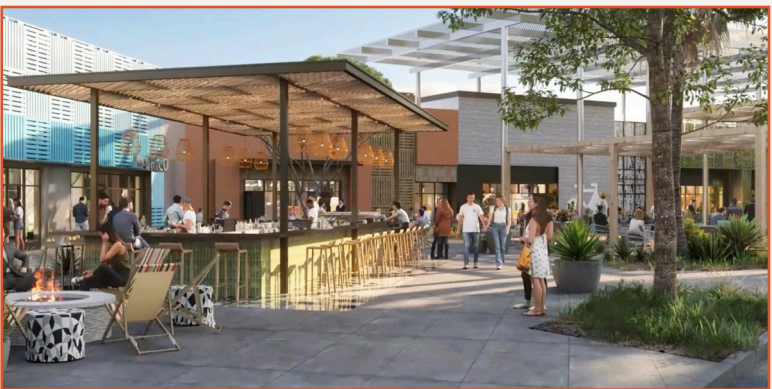
A OUTDOOR LOUNGE & EVENT SPACE